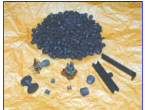
FSCP materials in injection moulding granules with moulded parts